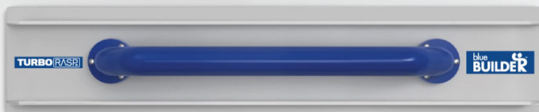
2' RASP (W-TURB2)